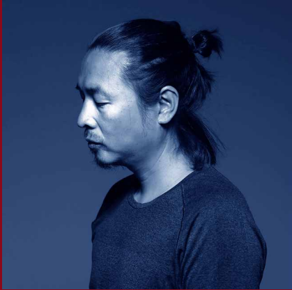
美術總監 Art Director