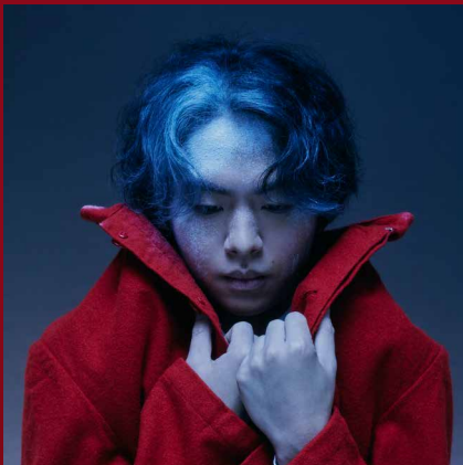
音樂總監 / 鋼琴 Music Director / Piano